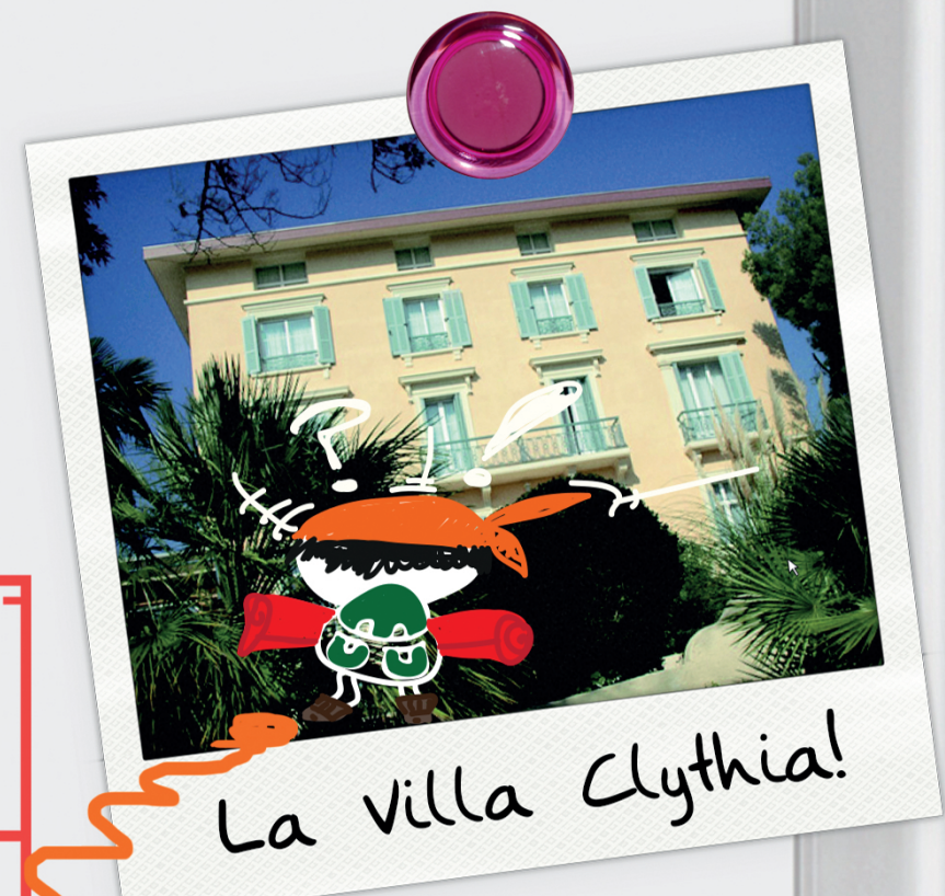
La Villa Clythia!